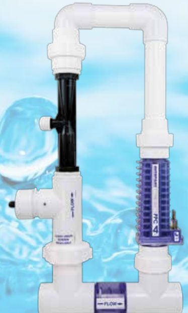
Pool Pilot® Digital Nano with CoPilot® & PPM1 Manifold Recommended for Pools up to 55,000 gallons/208 m 3